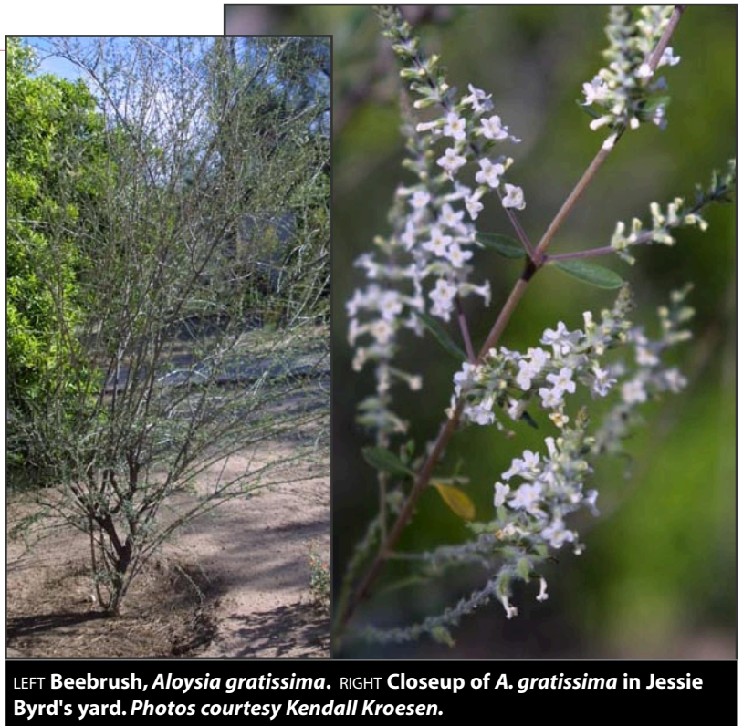
LEFT Beebrush, Aloysia gratissima . RIGHT Closeup of A. gratissima in Jessie Byrd's yard.

The leaves are tiny, so when they drop during cold weather, the leaf litter can stay under the shrub without looking messy. The branching structure is delicate, with lots of small branches that provide great cover for birds. It's not dense enough to provide much of a screen, but it would be a great background plant. Beebrush is a prolific self-seeder, so it's great for gardens with wild patterns, but not formal spaces.